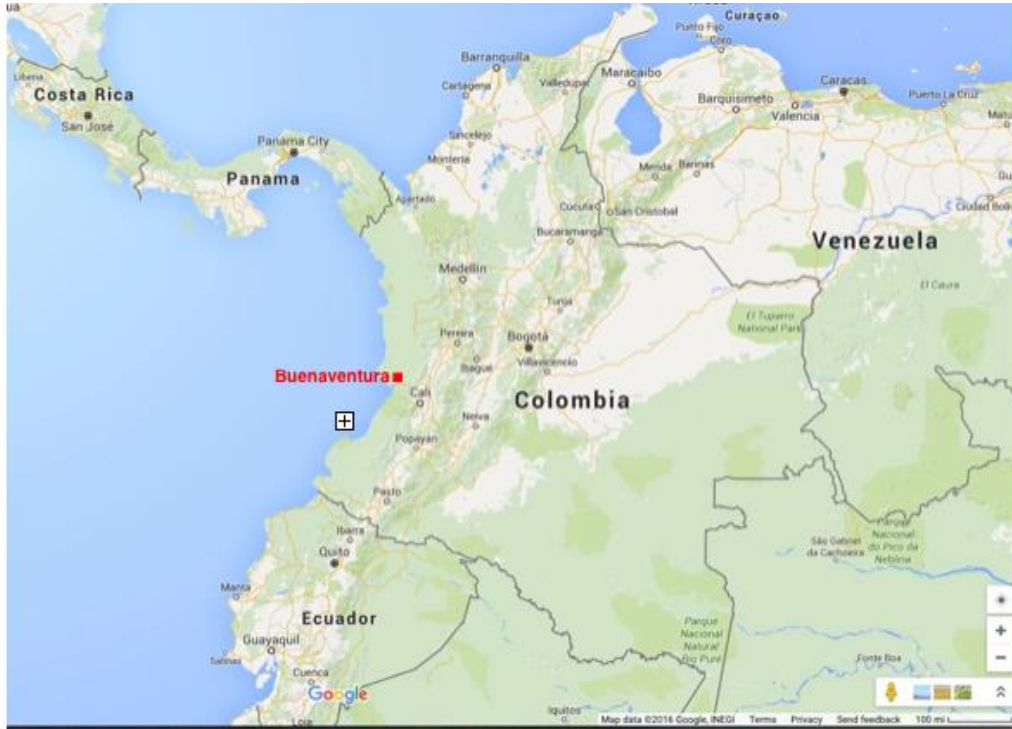
(Google Maps 2016).